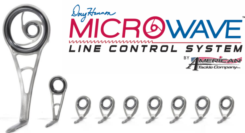
Innovation of the Year American Tackle – MicroWave Line Control System

Full details of the winners and runners up can be found on www.angling-international.com and www.eftta.com