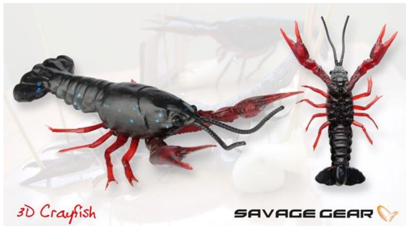
Visitors' Choice Savage Gear – 3D Crayfish