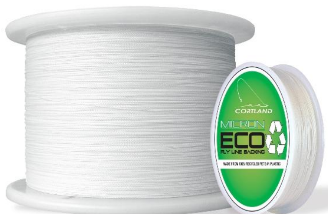
Eco Friendly Product of the Year Cortland Line – Micron ECO Backing